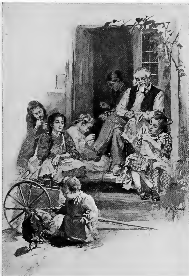
GREAT, THOUGH FRIENDLY, WAS THE RIVALRY BETWEEN THEM